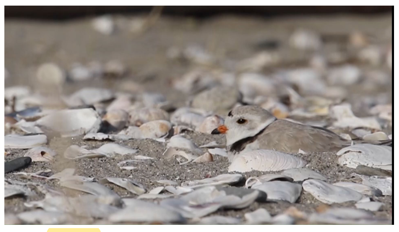
This video displays plovers demonstrating the "broken-wing" behavior and terns demonstrating "vocalizing" and "dive bombing" behaviors.