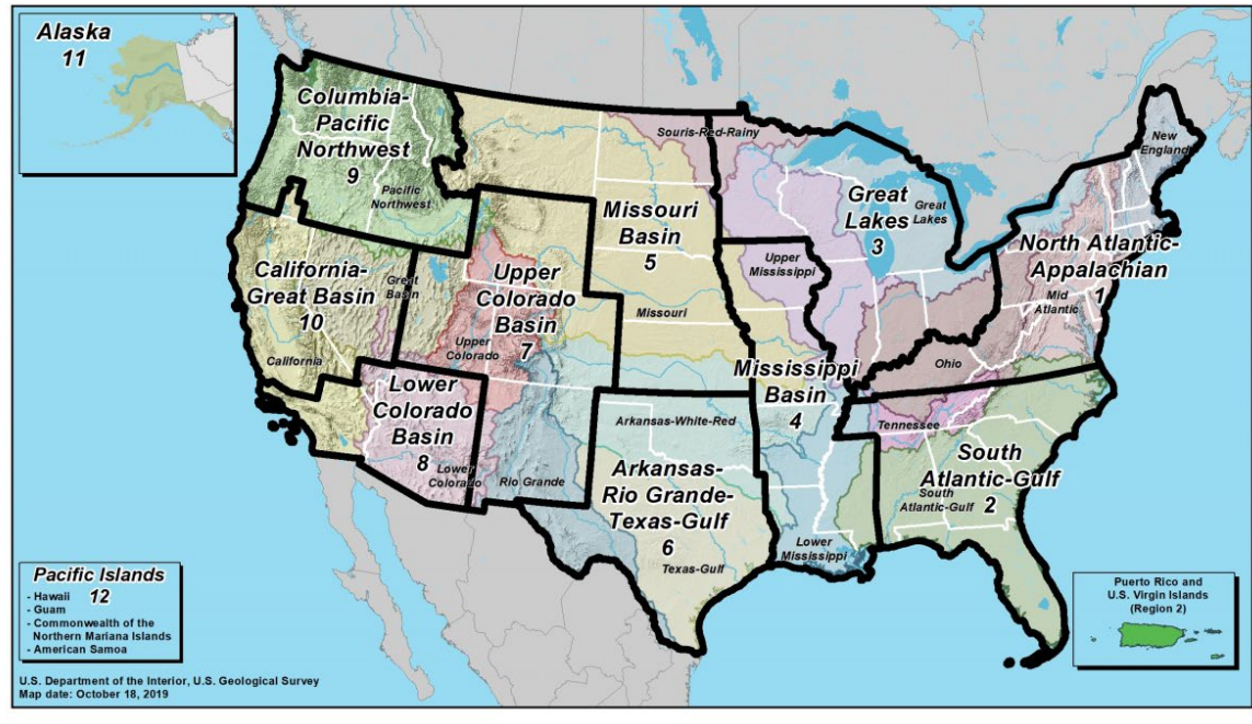
12 Interior Region Names Based on Watersheds

Region 1 also known as the "North Atlantic- Appalachian Region" consists of 14 states.