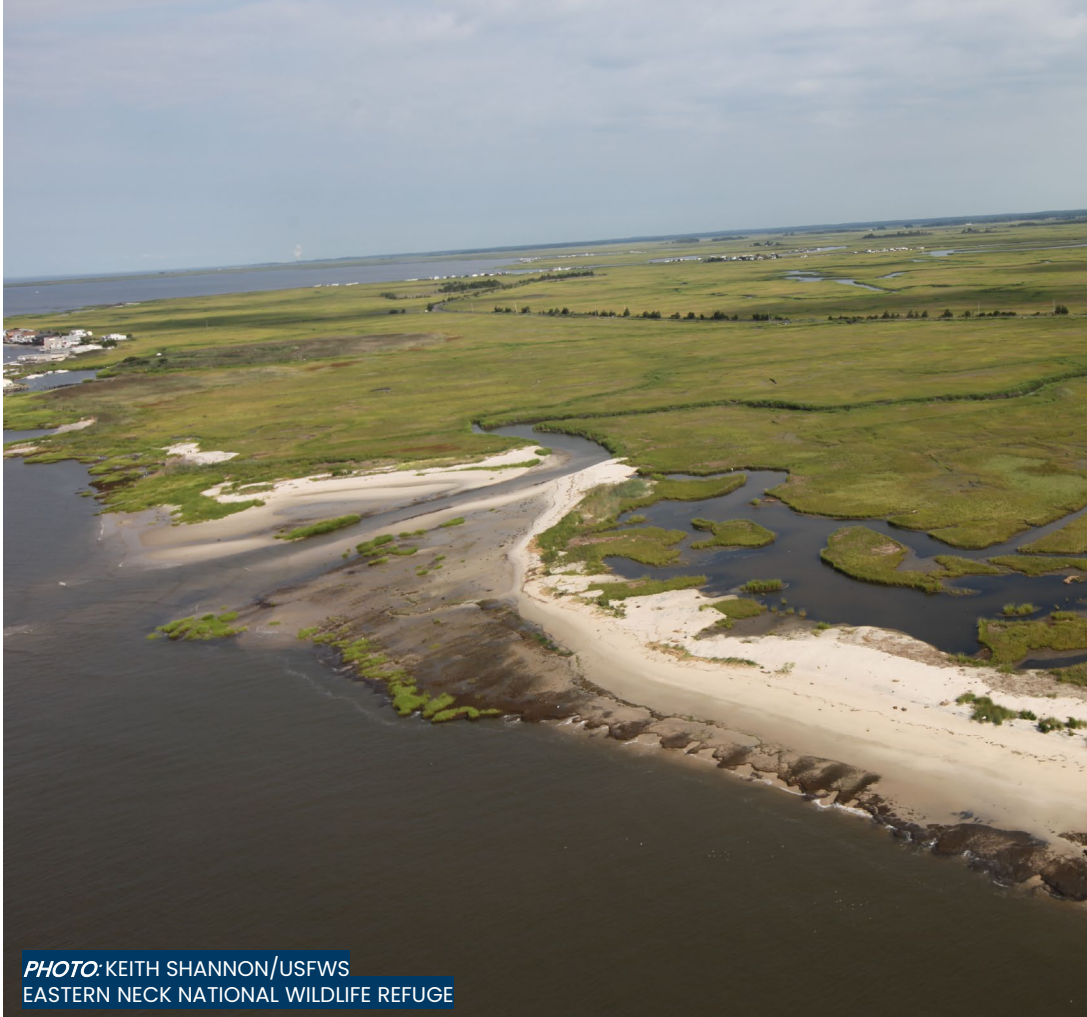
EASTERN NECK NATIONAL WILDLIFE REFUGE

“The mission of the System is to administer a national network of lands and waters for the conservation, management and where appropriate, restoration of the fish, wildlife and their habitats within the United States for the benefit of present and future generation of Americans.”