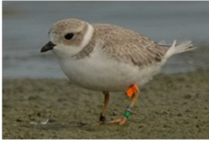
Piping Plover, Orange band - Great Lakes

Piping Plovers breed at Great Lakes, Atlantic, and Great Plains areas from April to July. In late July they migrate to southern coasts and Caribbean to winter until next spring. Seabrook is an important wintering & migratory site. Quality foraging & roosting habitat on winter beaches is key for adults to survive and return to breeding sites.