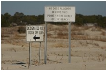
Town of Seabrook Ordinance. Subject to fine.

When off leash, dogs must be under voice control.