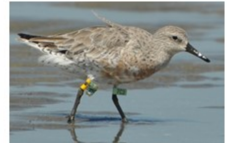
Red Knot with geolocator, North Beach

Seabrook Island has one of the largest single flocks of Red Knots in US, with thousands seen at a time during peak in Apr-May. Knot population on East Coast has declined 85% since 1980. Knots are "Federally Threatened" under the US Endangered Species Act.