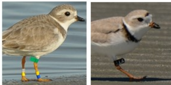
Green band - Atlantic US, Black band - Atl Canada All photos taken on Seabrook North Beach

Piping Plover bands are placed in various configurations on upper and lower legs. Flag/band colors define breeding area, and/or where bird was banded. Wintering Seabrook Piping Plovers are mostly spotted from Great Lakes, Atlantic US & Canada breeding areas.