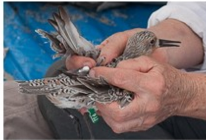
SC DNR placing nanotag for tracking

Banding tracks an individual bird to study the entire life-cycle - where they go, how long they live, what resources are needed for survival. During Red Knot migration on Seabrook, SC DNR teams apply new and identify existing bands, and place/retrieve geolocators and nanotags which provide data on movement.