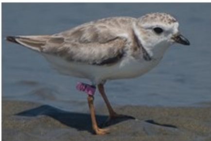
Piping Plover, Pink band - Bahamas

Populations and breeding habitats have drastically declined. Development, people, dogs, predators, weather, and environment are serious threats. Great Lakes area Piping Plovers are "Federally Endangered". Atlantic area are "Federally and SC Threatened".