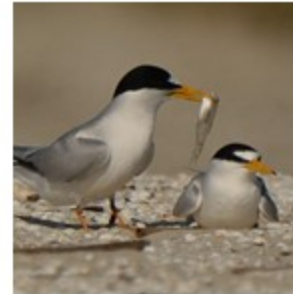
Wilson's Plover & Least Tern, North Beach