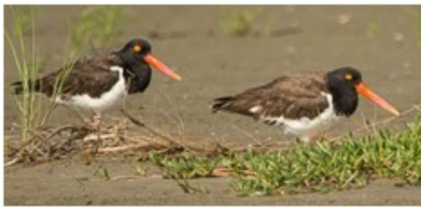
American Oystercatcher, North Beach