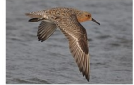
Red Knot, North Beach

Red Knots have one of the longest migrations of any bird, 18,000 miles round trip from the tip of South America to the Arctic where they breed. From March to early May, Seabrook Island is an important stopping point for them to feed and rest on their long journey north to breed.