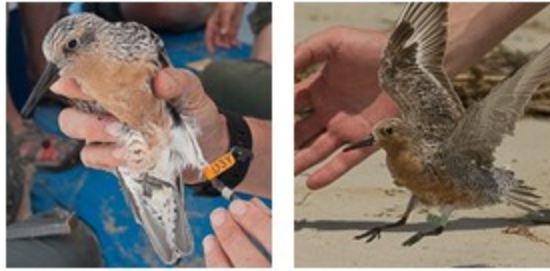
SC DNR Red Knot banding on Seabrook, Orange band - Argentina, Green band - SC

Banding tracks an individual bird to study the entire life-cycle - where they go, how long they live, what resources are needed for survival. During Red Knot migration on Seabrook, SC DNR teams apply new and identify existing bands, and place/retrieve geolocators and nanotags which provide data on movement.